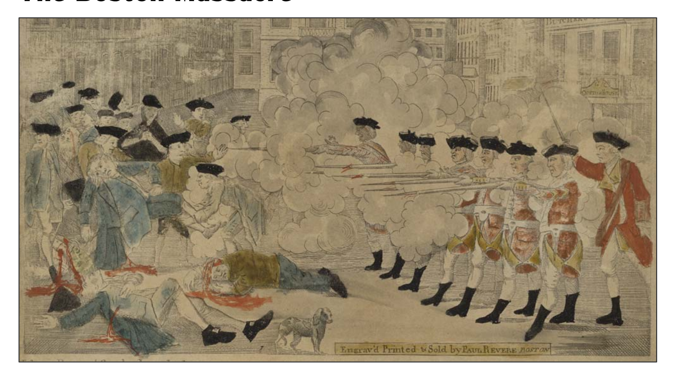
On March 5, 1770, British soldiers fired on a mob of colonists in Boston. This incident, known as the Boston Massacre, enraged American colonists.

In the years before the American Revolution, the British tried to take firm control over their American colonies. In the British view, British troops had protected Americans from the French, Spanish, and Indians. When a long war against the French ended in 1763, the king's minister announced in Parliament: Great Britain protects America; America is bound to obey.