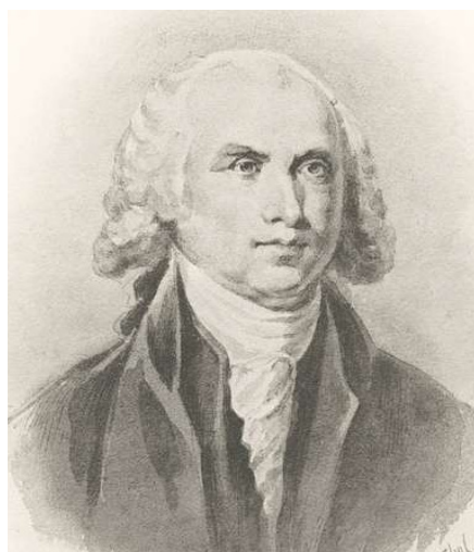
James Madison

Hamilton published his first essay in the New York Independent Journal on October 27, 1787. He signed the articles with the Roman name “Publius.” (The use of pseudonyms by writers on public affairs was a common practice.) Hamilton soon recruited two others, James Madison and John Jay, to contribute essays to the series. They also used the pseudonym “Publius.”