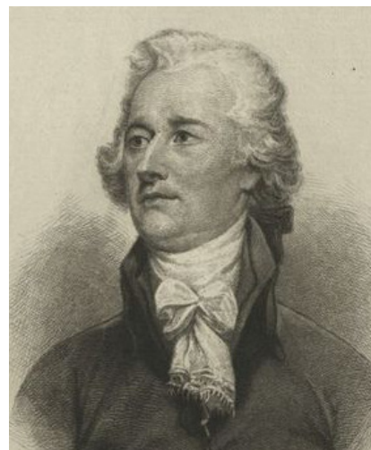
Alexander Hamilton.

It is not surprising that Hamilton, a brilliant lawyer, came forward at this moment to defend the new Constitution. At Philadelphia, he was the only New Yorker to have signed the Constitution. The other New York delegates were convinced that the rights of the people were being abandoned. They angrily left the Convention.