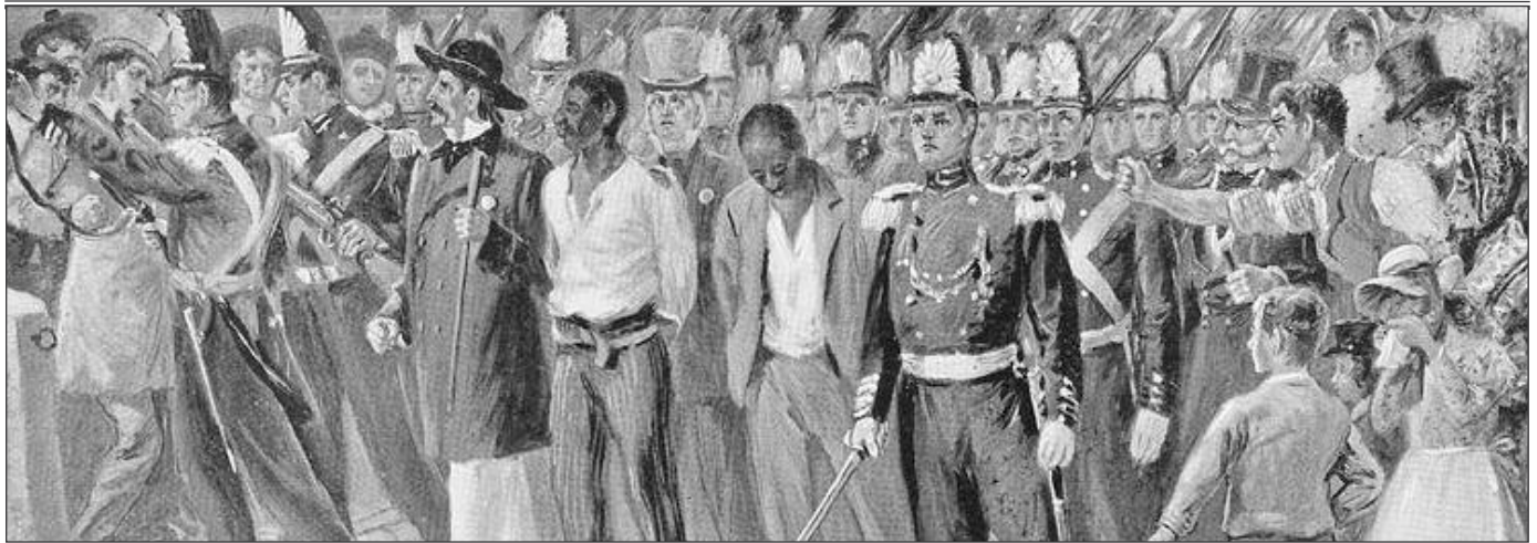
The New York Public Library

This 1899 image shows Anthony Burns and Thomas Sims marched through Boston as they were returned to slavery. Actually, Sims was returned in 1851 and Burns in 1854. Boston abolitionists bought Burns's freedom in 1856. He returned to Boston. Sims later escaped again in 1863, and U.S. Attorney General Charles Devens appointed Sims to a position in the Department of Justice.