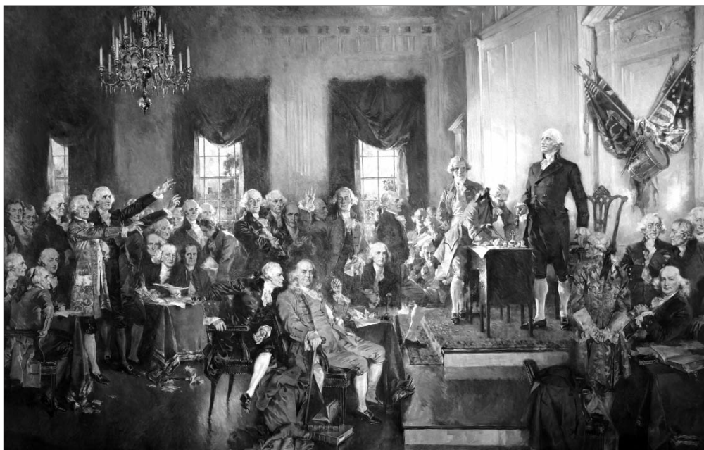
Delegates at the Constitutional Convention wait their turns to sign the U.S. Constitution.

In February 1787, Congress decided that a convention should be convened to revise the Articles of Confederation, the nation's first constitution. In May, 55 delegates came to Philadelphia, and the Constitutional Convention began. Debates erupted over representation in Congress, over slavery, and over the new executive branch. The debates continued through four hot and muggy months. But eventually the delegates reached compromises, and on September 17, they produced the U.S. Constitution, replacing the Articles with the governing document that has functioned effectively for more than 200 years.