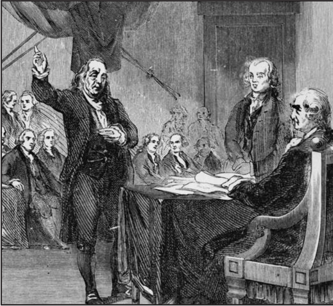
Benjamin Franklin, shown standing on the left in this engraving, was the oldest delegate to the Constitutional Convention.