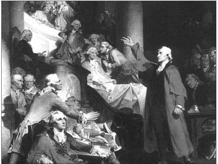
"PATRICK HENRY Before the Virginia House of Burgesses" (1851) by Peter F. Rothermel shows Patrick Henry making a speech against the Stamp Act of 1765, when he famously declared, "If this be treason, make the most of it!"

Four colonies adopted constitutions even before the Declaration of Independence was proclaimed on July 4, 1776. After that date, all the colonies