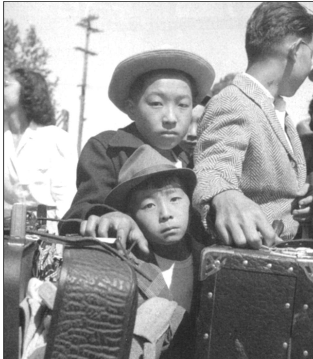
Two boys huddle with their family waiting for a train to take them to a relocation center.

In 1940, 127,000 persons of Japanese ancestry lived in the United States, mostly in California. Sixty-three percent of them were Nisei, American-born citizens. For most of the Issei and Nisei, life was good. Then Japan attacked Pearl Harbor.