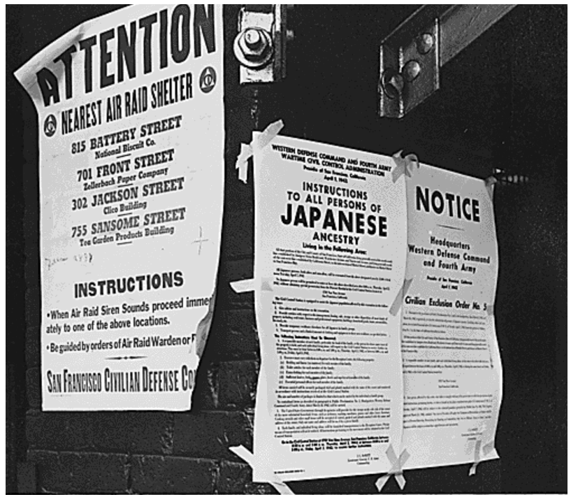
Posted on the wall of a San Francisco air raid shelter in 1942, this notice ordered people of Japanese ancestry to report for evacuation within one week.

Born of Issei immigrant parents in Oakland, California, Fred Korematsu was a Nisei and an American citizen. He was 22-years-old in 1942 when General DeWitt ordered everyone of Japanese ancestry in the Western United States to report to assembly centers. But Korematsu was in love with an Italian-