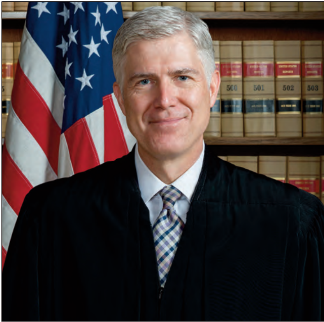
The majority opinion in the Bostock case was written by Associate Justice Neil M. Gorsuch.

“Today, many Americans know individuals who are gay, lesbian, or transgender,” wrote Alito, “and want them to be treated with the dignity, consideration, and fairness that everyone deserves. But the authority of this Court is limited to saying what the law is.”